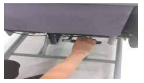
Take hold of the handle at the rear of the seat module and slide the complete assembly backwards and/or forwards to the desired length.

Tighten the butterfly knob ensuring the seat is fully secured after adjusting.