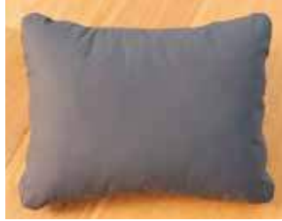
Weighted Head Pillow