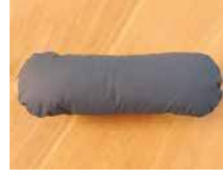
Weighted Neck Cushion