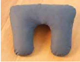
Weighted Neck Support

To fit the headrest, simply position the headrest over the top of the back of the chair, with the weight hanging down the rear of the back module. Then position the headrest to suit the user, the weight will hold the headrest in the correct position.