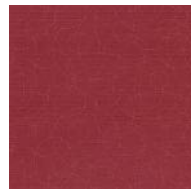
Venture 609 Rose