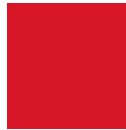
Zest 440 Scarlet