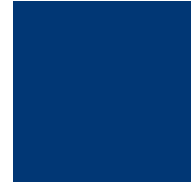
Voyage 105 Indigo