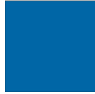
Zest 117 Royal