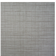
Etch 837 Stone