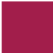
Zest 444 Cherry