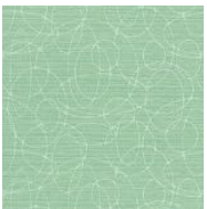
Venture 155 Duck Egg Blue