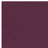
Venture 624 Mulberry