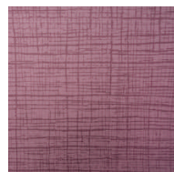
Etch 664 Maive