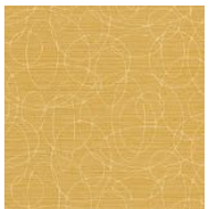
Venture 321 Wheat