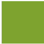
Zest 222 Apple