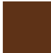
Voyage 807 Mushroom