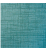
Etch 129 Ocean