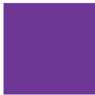
Zest 128 Violet