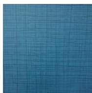
Etch 122 Wedgewood Blue