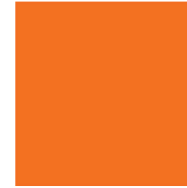
Zest 438 Tangerine